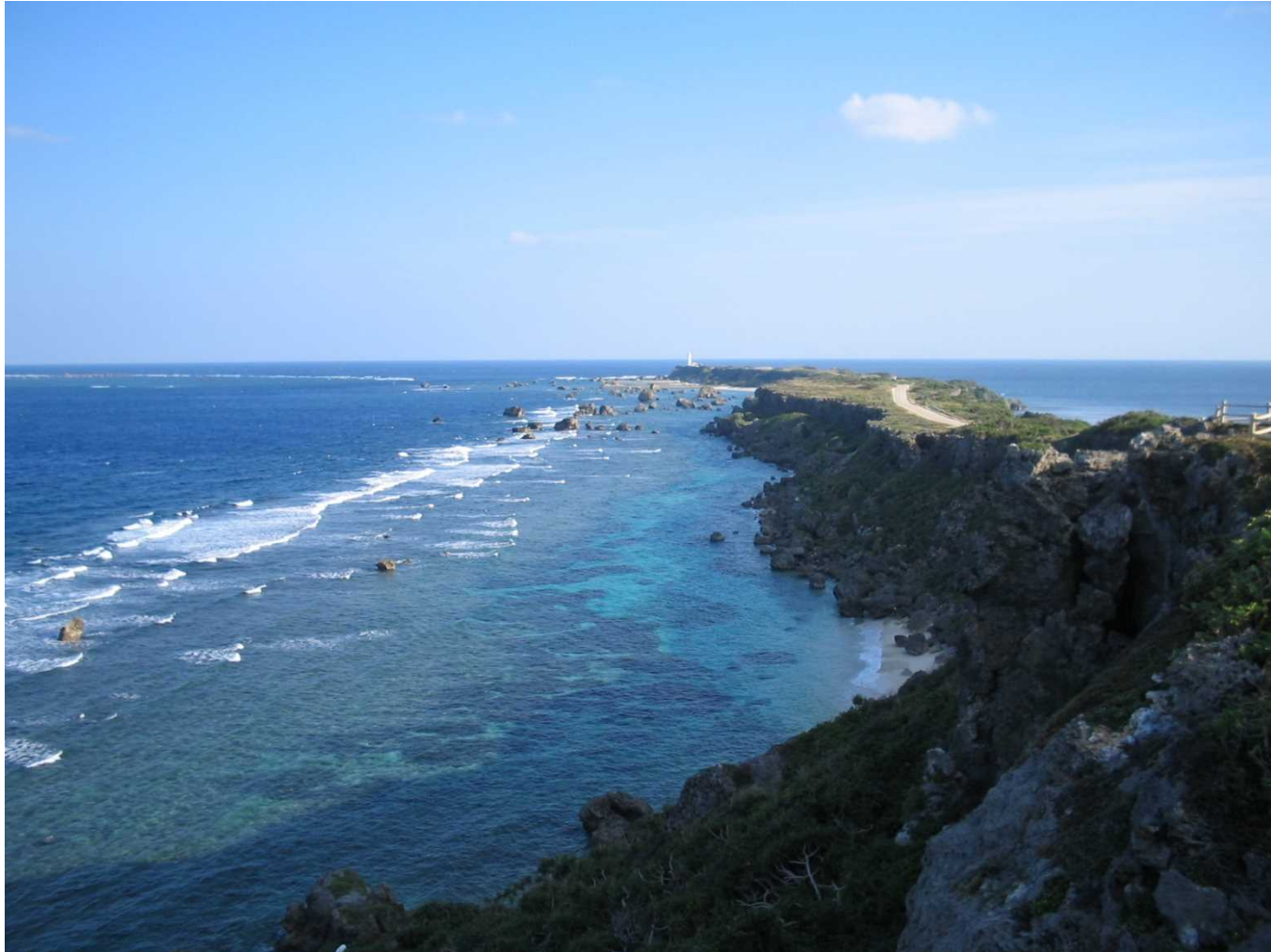
Miyako Isld. Okinawa, Japan